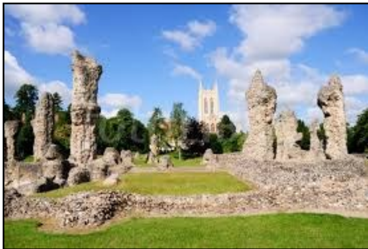
Abbey ruins, Bury St. Edmunds, Suffolk, England

were used to defending themselves against Scottish raiders. It was these northerners who, goaded beyond endurance, in the summer of 1213 refused a royal demand for scutage. In this they were acting beyond their rights, for it was part of the feudal law that an overlord could tax his tenants-in-chief to support his wars. But they maintained that such a right could be denied if it was not used justly and within the limits set by custom.